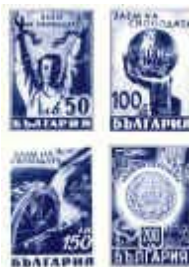
One of my favourite sets as a mini sheet.

One difficulty was getting the lady behind the counter to understand what I wanted. Her English, like my Bulgarian, would fit on a stamp hinge. Somehow she understood. In the Antiques shop, though, it was totally different. The owner spoke good enough English for us to get by. I'm itching to go back to Varna, but I don't know when it will be. I want to fill the gaps, and there is a lot to fill.